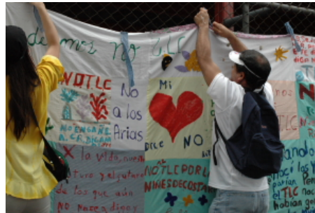
La Manta de los Sueños, an initiative of 'Women against CAFTA'