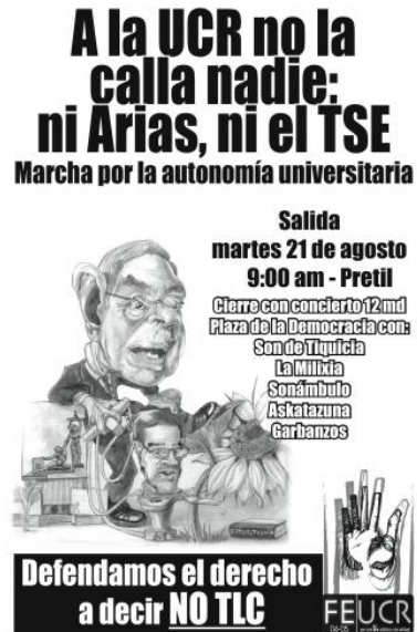
Picture 4.1 Poster of Federation of Students of UCR

'Nobody silenced UCR: neither Arias nor TSE' 'Street demonstration defending the university autonomy' 'Let's defend the right to say NO'