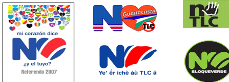
Figures No 5.1 Diverse NO hearts