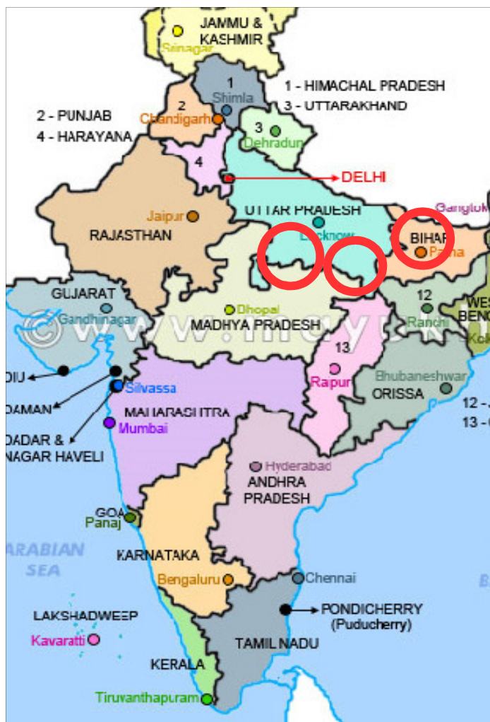
Figure 1: Location of the Three CBHI Projects