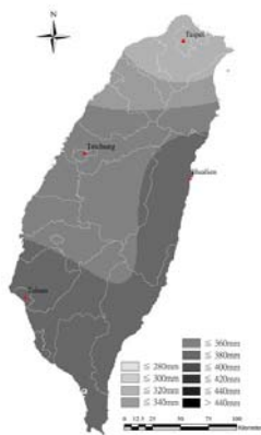
Figure 2 20-year return level