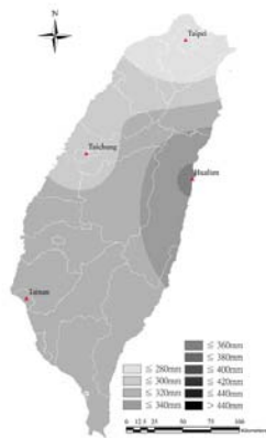
Figure 1 10-year return level