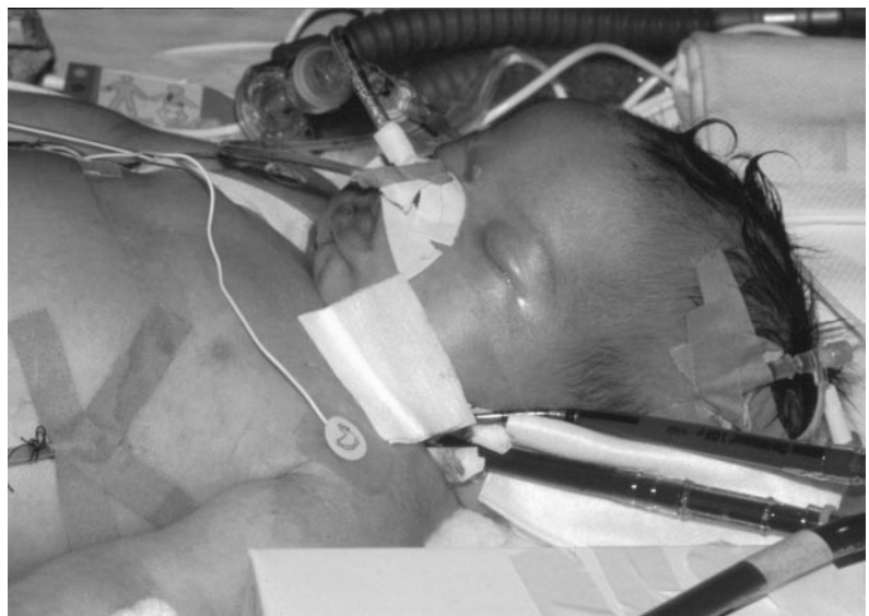
Fig 3. The individualized VA-ECMO approach, with cannulation of the left jugular vein and the left carotid artery.

Etiologic factors in situs inversus are unknown; familial occurrence suggests multiple inheritance patterns. Genes involved in human situs anomalies include ZIC3 (zinc finger transcription factor), LEFTB (transforming growth factor B-related factor), ACVR2B (human activin receptor type IIB), and Cryptic. 9 Mutations in these genes have been found in patients with laterality defects. 10 Strikingly, the inversin knockout mouse showed, in addition to a situs defect, an eventration of the diaphragm in 1 of the offspring, suggestive of a common developmen-