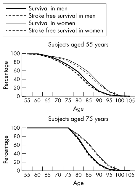
Figure 3 Survival and stroke free survival according to age and sex.

were confirmed by CT or MRI, the overall results on haemorrhages should be regarded carefully. Almost 95% of the cerebral infarctions were CT confirmed. Therefore, we feel that the overall figures on cerebral infarctions are reliable. However, incidence figures of stroke subtypes in the very old are less reliable.