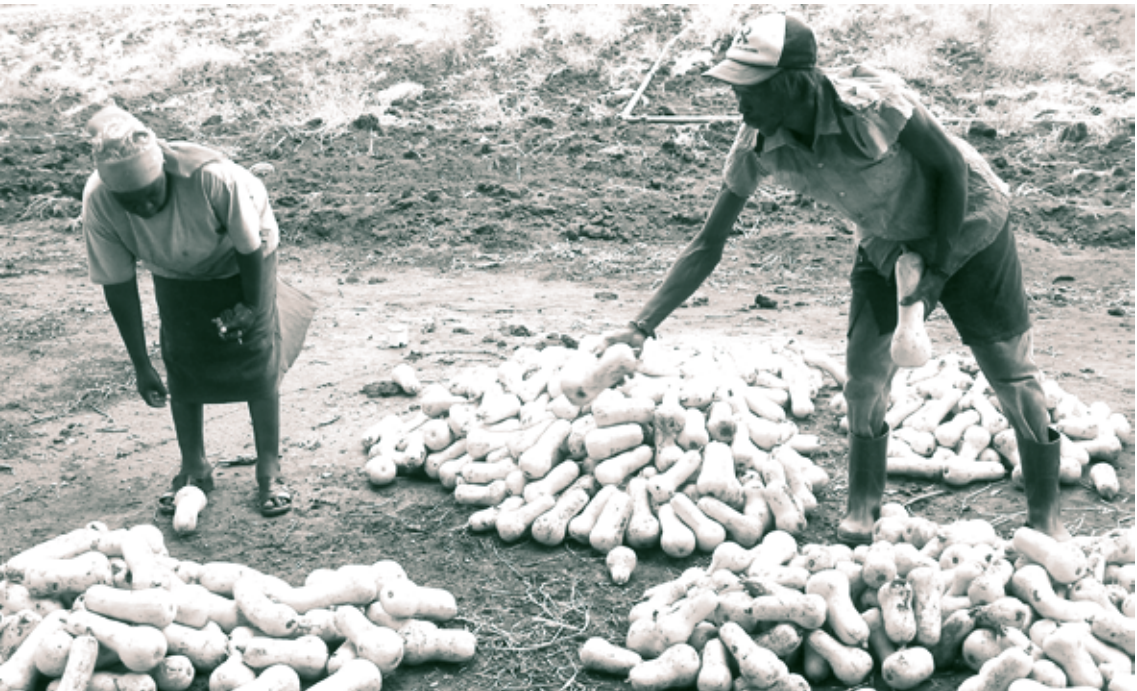
Above: Farm workers whose views on social research were elicited.

OUTCOMES OF THE RESEARCH: You should always know how to obtain feedback about the research. This could take place in different forms which are generally discussed with the leadership of the community or leading institutions in the community. These could include oral or written feedback. Oral feedback could take place with the leadership, larger groups or general community meetings. The printing and binding of entire academic reports (theses) is expensive and only one or two copies may be made available on a community level. You may nonetheless request that several copies of a summary report of the research be made available in printed form. Once you have been given feedback about the research and the researcher's analysis and conclusions, you may respond to these and discuss your views with the researcher. Should you have any