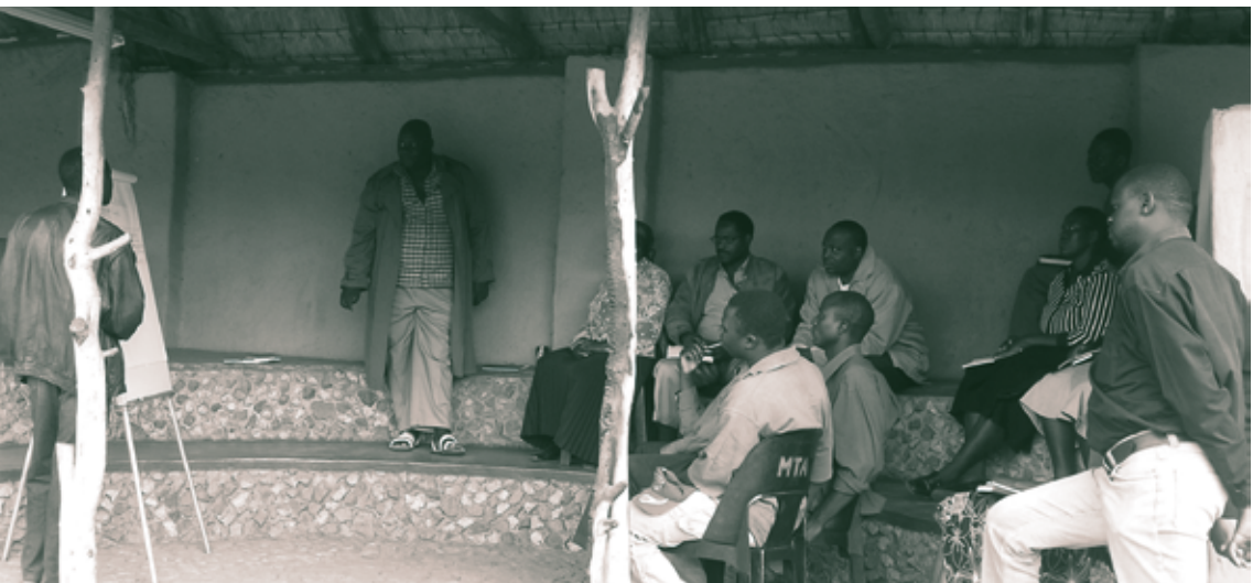
Above: Break-away session during Makuleke Workshop, October 2005.

One potentially useful tool for facilitating feedback to local people, and dialogue between them and researchers was already identified at this stage, namely a community web-portal. This was seen as an important way to disseminate information within local communities and to researchers located elsewhere in the world. Such a website would also help to reduce the research fatigue resulting from the large number of researchers visiting communities and repeatedly asking the same questions.