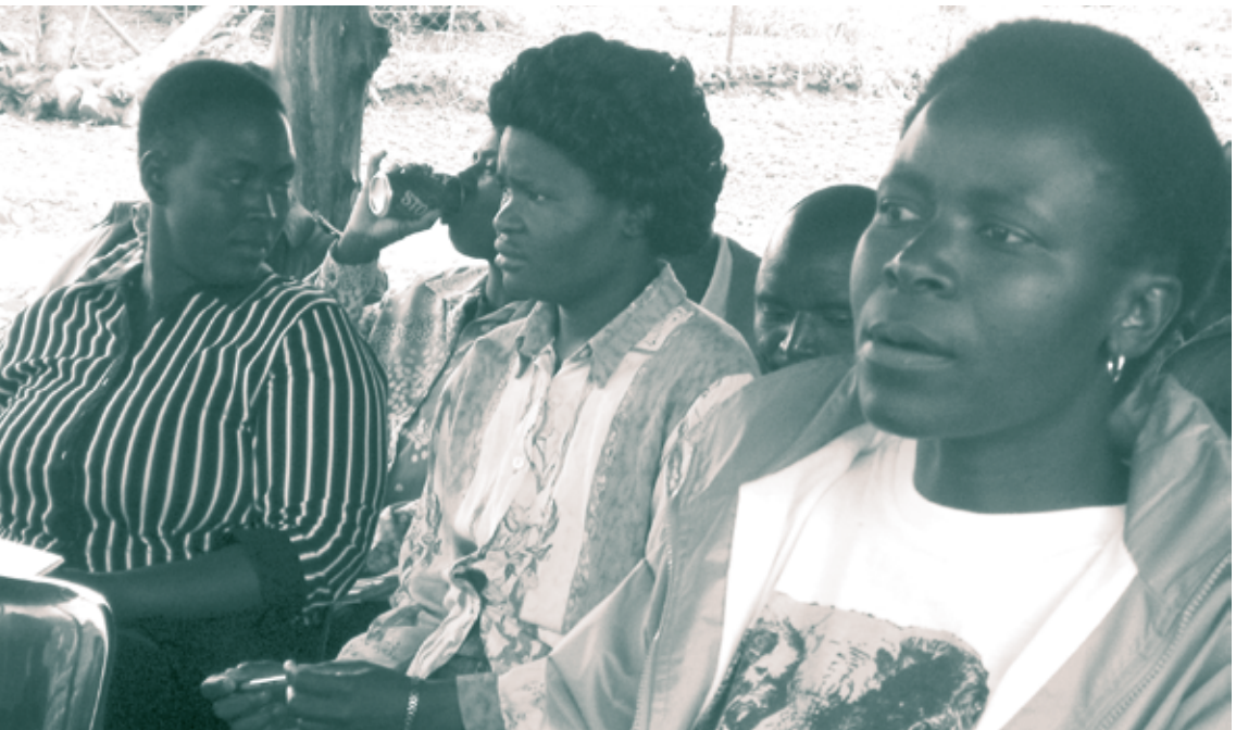
Above: Participants included women representatives of Makuleke CBOs.

NOTIFY THE COMMUNITY: The relevant local leadership structure should be notified when the researcher has completed their fieldwork. This should include a short description of how the fieldwork went, any preliminary insights, expression of thanks, and discussion of the way forward. The next steps in the research process and the time that it will take before results are ready for feedback must be made clear.