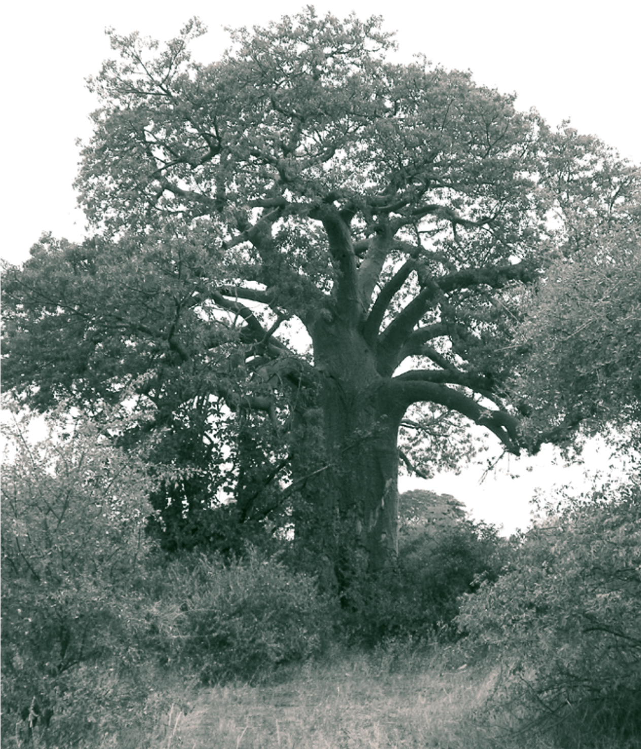
"Deku's Tree" in Old Makuleke: A reminder of local communities' heritage within Transboundary Protected Areas.