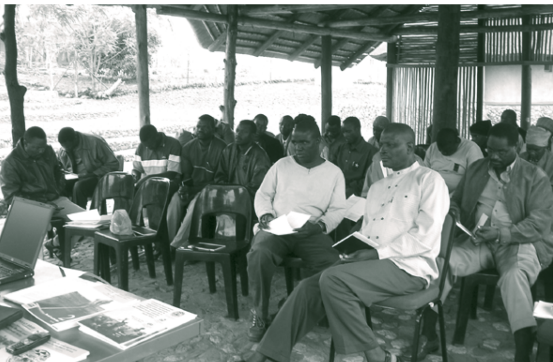
Above: Makuleke post-Indaba workshop, October 2005