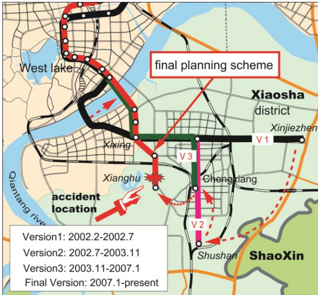
Figure 3 Changes in the route of subway line 1 from 2002 to 2007

where the Hangzhou government could intervene at any time to secure its income from real estate development made regular adjustments in the route line 1 a key phenomenon to understand the outcome of the events. All along the way, the Hangzhou government has promoted this innovative procurement model and failed to see possible downsides. As a result, the itinerary underwent countless changes.