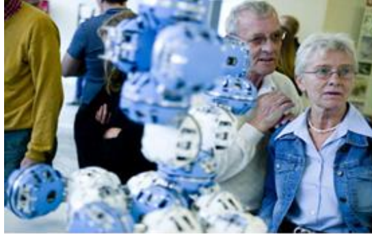
Fig. 5. The Atron modules exhibited at Brandts Museum, Odense, Denmark, 2007.

Atron modules is a self-assembling shape chain of robots-atoms that, by using mastered/centralized or collective A.I. “reasoning” changes its own shape along the time. This perpetual changing artifact could be located at the junction between the robot art and kinetic sculpture art fields.