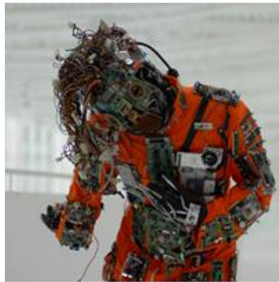
Fig. 2. “Fatherboard, the Superavatar”, by Luigi Pagliarini. 2007.

Further, inspired by the Gutai [16], Tanaka [16], Stelarc [7] and Marcellì [8] (amongst others) we initiated an artistic investigation, which we term Modular Robotic Wearable (MRW). The Modular Robotic Wearable [17] thought was born in 2007 from both the research line in electronic and robotic art – called The SuperAvatars (see Fig. 7). MRW is related to Wearable Computing or WearComp – a branch of research on forms of human-computer interaction comprising a small body-worn computer (e.g. user programmable device) that is always on and always ready and accessible.