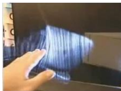
Fig. 3. A visitor interacting with the Mid Air Shark holographic projection, Ximo Lizana, 2007.

Also, it is worth to spot Ximo Lizana’s new research on 3D holographic projected sculptures (e.g.: the “Mid Air Shark”, 2007. [10] Fig. 3). This technique opens a new horizon (we might name virtual robot art ) to the robot art field here intended as a three dimensional object occupying a given physical space and interacting, by now in a naïve way - with the surrounding ambient.