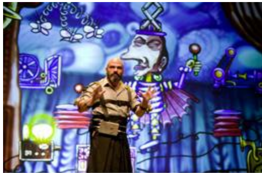
Fig. 2. Marcel.li Protomembrana during Robots at Play 2007.

The Haile Robot developed by Gil Weinberg, Scott Driscoll and Travis Thatcher [9] is interesting because of its own way of exploring the concept of machine creativity and, parallel, the ability of robots to cooperate and collaborate (in what the author calls musicianship) with humans while producing art, run-time.