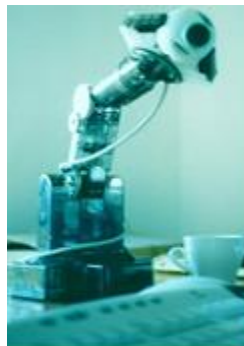
Fig. 1. The Robot Arm-Eye used in “LifeGrabber”, by Luigi Pagliarini. 2003.

A different example of the evolution of the human-machine relationship imprinted by robot art works is in the ‘full-loop’ realized in LifeGrabber by Luigi Pagliarini in 2003 [15]. A webcam mounted on a robotic arm, controlled by a software written by the artist himself analyzes the audio/video inputs run-time, through a population of Alife agents which, in turn, influences both the audio/video output and the robot arm movements (therefore the future vision of the robot, see Fig. 6). While pointing at itself, this robot art piece gives birth to a ‘self-observing machine’ , facing one of the most fascinating topics for future computer based art works, the philosophical problem of self-consciousness.