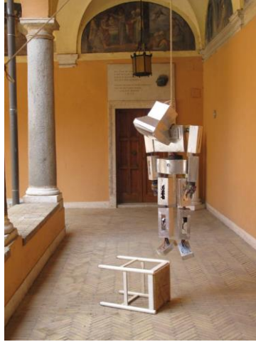
Fig. 10. Intelligenza by Luigi Pagliarini, 2010.

Besides that, of course there are and there will be many different and noble exceptions and mutations that will keep the evolution of the area funny and interesting.