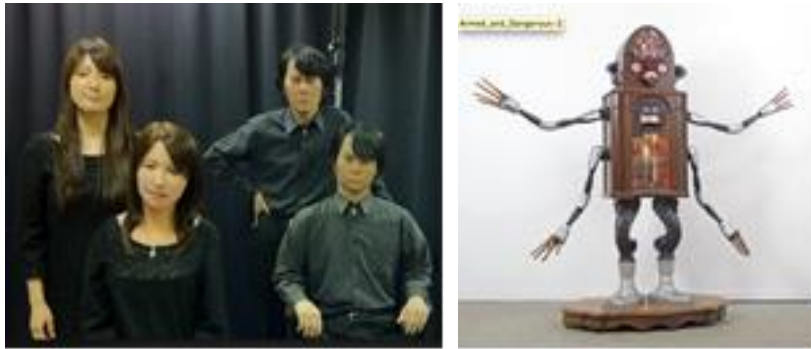
Fig. 4. (Left) Hiroshi Ishiguro's Geminoid. (Right) Nemo Gould's Armed and Dangerous.

Finally, one must considered works like those by Hiroshi Ishiguro's Geminoid (Fig 4 left [12]), an example of how invasive can technology be; on the opposite side, Nemo Gould's Armed and Dangerous (Fig 4 right, [13]) representing the typical artistic ironic sight given to the world of war oriented robots; and many others.