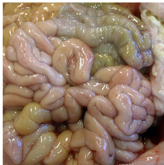
Figure 2 Normal intestine of 3 days old non-diarrhoeic piglet. The small intestinal wall has a normal thickness. Different parts of the intestine show different stages of peristalsis, reflecting normal peristaltic capacity.