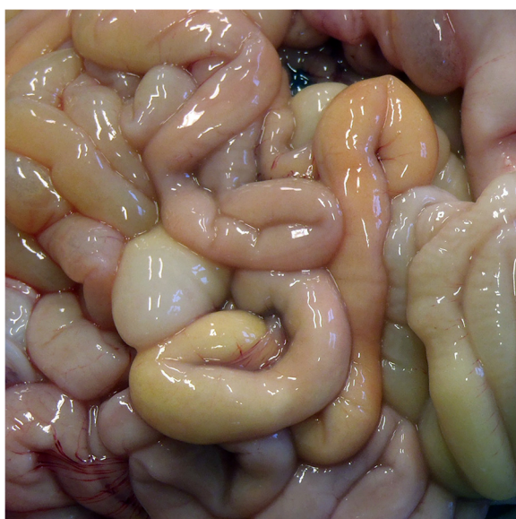
Figure 1 Flaccid intestine of 3 days old diarrhoeic piglet. The small intestine is thin-walled and flaccid throughout its length. The intestine appears to lack its normal peristaltic capacity, since no sections are contracted. Colon (in the right side of the picture) has liquid contents.

A poor body condition and dehydration were rather prevalent findings in diarrhoeic piglets in this study. However, unless very pronounced, these features are not characteristic for specific diarrhoeic syndromes, since they merely reflect the loss of nutrients and water associated