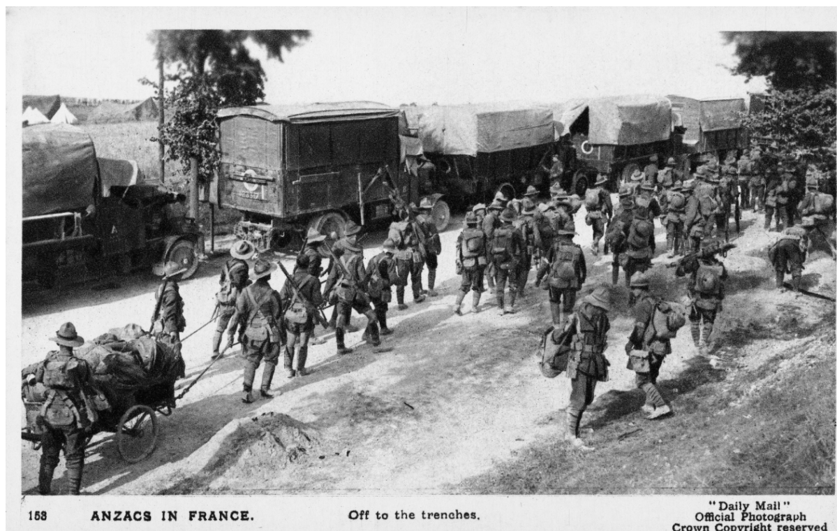
Figure 1. Daily Mail (London): ANZACS in France. Off to the trenches (circa 1916) Alexander Turnbull Library. Official war pictures, no. 153. [Postcard. ca 1916]. Reference Number: Eph-POSTCARD-WWI-01. 2012 [cited January 2013]; Available from: http://timeframes.natlib.govt.nz/

Military camps in NZ were hit hard by influenza in late 1918. Narrow Neck Camp in Auckland was the one of the first populations in NZ to experience an influenza outbreak; an October wave affected 30–40% of the camp (with no deaths), and the November wave affected ~50%. 10,12,15