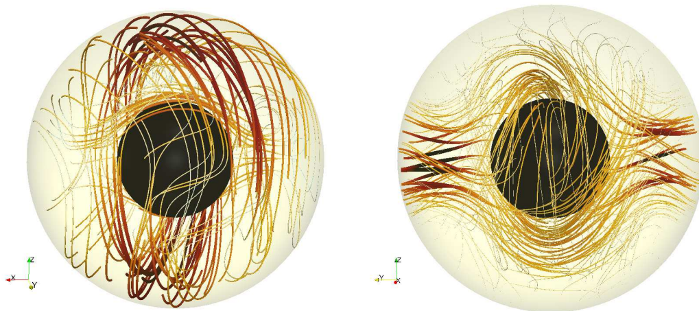
FIG. 3: (Color online) Magnetic eigenmodes close to the onset for kinematic dynamo action driven by the S_2^2 T_2^2 reversible flow. Left: the boundary conditions are perfectly-conducting (no normal field). Right: the boundary conditions correspond to a pseudo-vacuum (no tangent field). In both cases, the magnetic field is dominated by a strong m = 1 mode. The magnetic field lines are initiated randomly in the spherical shell. The dark and thick magnetic field lines correspond to large magnetic field amplitude whereas bright and thin lines correspond to low magnetic field magnitude. The growth rate associated with these two eigenmodes is exactly the same.

The growth rates for the two types of boundary conditions are however clearly distinct for the non-reversible S_2^0 T_2^0 flow (see figure 2). Since the azimuthal magnetic modes are decoupled, we only show the growth rates associated with the most unstable mode m = 1 . In that case, a dynamo is observed in the case of perfectly-conducting boundary conditions whereas no dynamo at all is found with an infinite magnetic permeability. As already mentioned, this flow shares some similarity with the mean velocity field of the VKS experiment. The effect of the magnetic boundary conditions on the dynamo threshold of von Kármán swirling flows has been studied by [13]. The lack of dynamo in the infinite magnetic permeability case is due to the presence of the large inner core in our case. As the size of the core is reduced, we recover the dynamo observed by several studies, with a strong equatorial dipole.