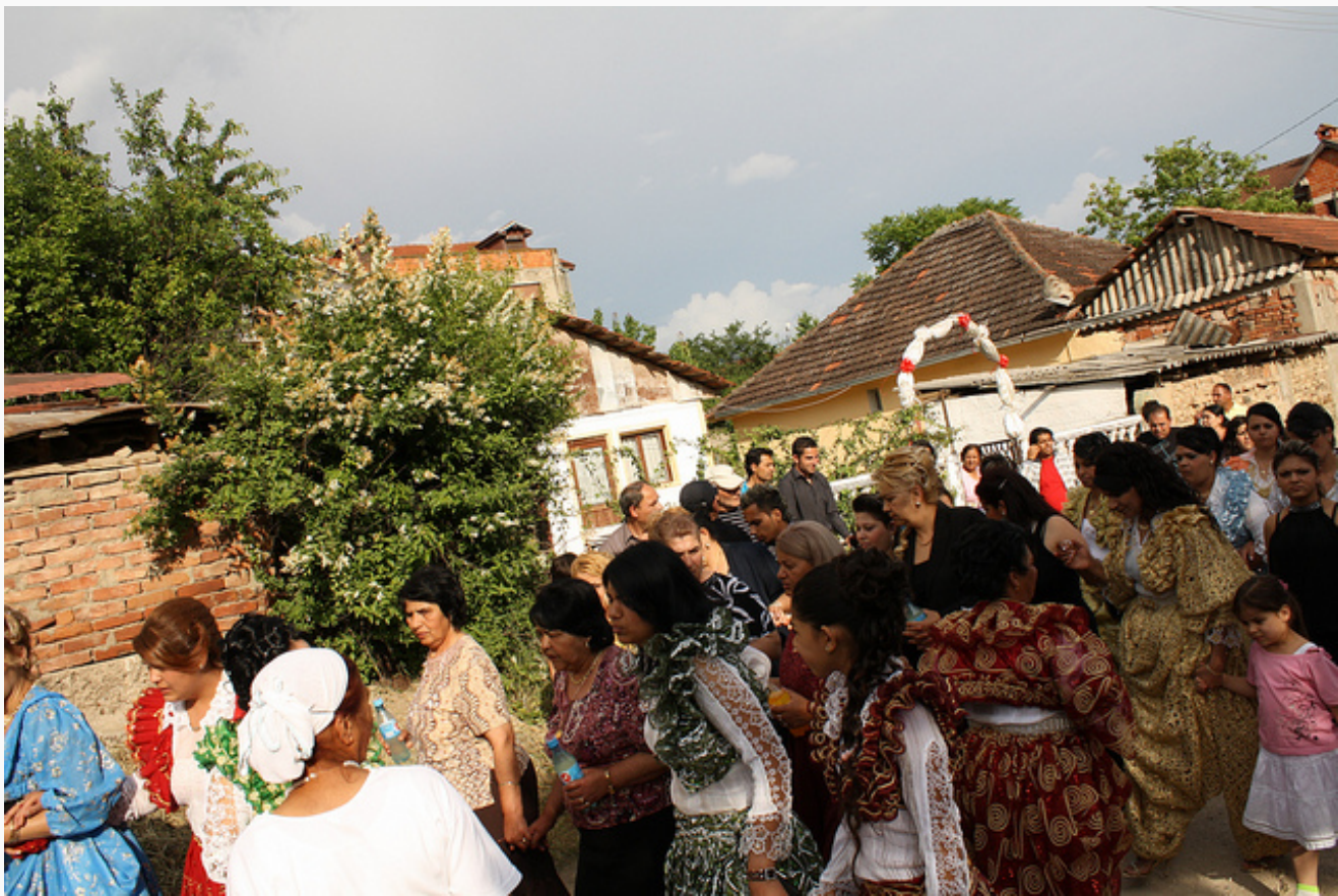
Macedonian Roma community in celebration.