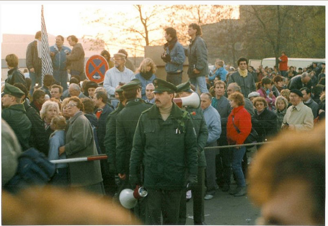
The fall of the Berlin Wall, November 1989.