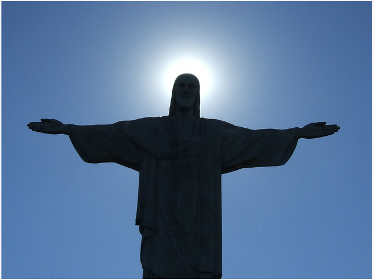
Christ the Redeemer statue, Rio.

While this all makes a considerable concession to the contextualist position that Habermas had hitherto strenuously rejected in favour of context-transcendence, in the view of Thomas MacCarthy it makes too strong demands of faith. Overall, the contextualist position appears to command the most support. In the end the translation thesis is probably indefensible, thus reducing the post-secular argument to the less controversial socio-historical thesis on modernity and the related problem of the degree to which religion can be permitted in the public sphere. For this reason it is hard to agree with the strong argument of Milbank that religion should be put on a more equal level with reason. What this argument forgets is that secular reason commands greater support than religion, which is divided confessionally. Curiously there is little engagement with non-Christian religions. Habermas's problem is that, in the terms of Amy Allen, he want 'to have his cake and eat it', that is, he wants to salvage the potentially positive aspects of religion without sacrificing too much of reason. Salvaging the positive aspects is undoubtedly easier than disposing of the negative ones.