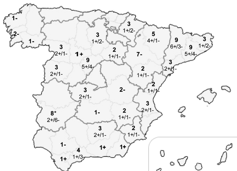
Figure 1 Geographical distribution of the sampled pig farms (n = 100) throughout Spain. The regions are delimited by dark grey lines and their provinces are delimited by light grey lines. The numbers in boldface indicate the total number of farms sampled at the indicated province, and the occurrence or absence of recent diarrheic outbreaks in the sampled farms is indicated by a "+" (n = 47) or "-" (n = 53) symbol, respectively. The asterisk symbol (*) indicates the only 8 sampled locations where pigs were raised outdoors.

All the farms surveyed had seropositive animals, and in 69 of them all the sera analyzed were positive. Figure 2 summarizes the numbers of farms in which all the animal sera tested from a given age were positive, versus the numbers of farms in which some negative samples were found. Only the farms from which 9 or more