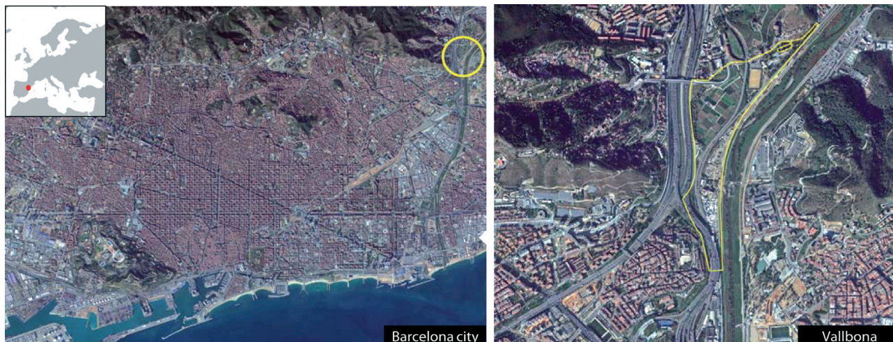
1. Location and aerial photograph of the Vallbona neighbourhood (12).

other (general systems protection 3.4%) and because it has been faithful to its traditional agricultural uses).