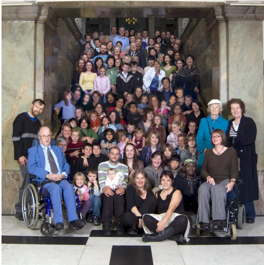
Figure 3: Welcome Stories Photograph, 18 October 2008, Lancaster Town Hall