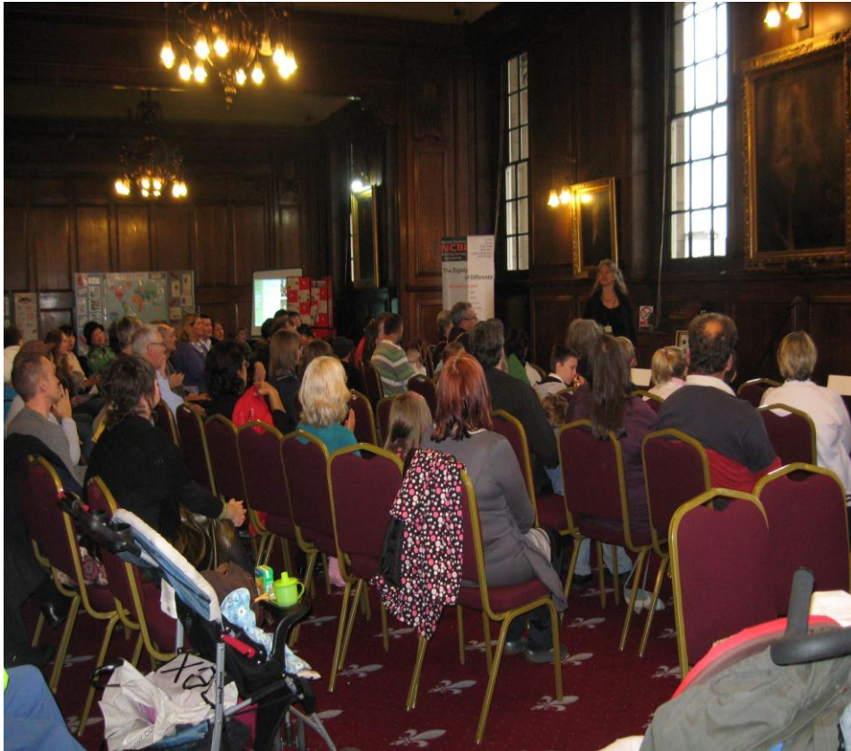
Figure 2: Welcome Stories celebration event

As part of ensuring a dialogue between those working on the project, those being interviewed and the wider public a number of events took place which allowed local people to be involved in and give their feedback on the progress of the project. These included sessions in local libraries, pieces in the local press, involvement with the local community radio station, stalls at a community festival and participation in a youth group event. The final event, at the culmination of the project, was a large celebration event to which all those who had been involved were invited to gather together, eat, meet each other, celebrate the project and hear some of the stories (see Figure 2). All those involved were given copies of their interviews and cards thanking them for their participation. At this event the second Welcome Stories photograph was produced, with all those who attended the event and had been involved in the project taking part in a group photo on the steps of Lancaster Town Hall, the location used for the initial photograph (see Figure 3).