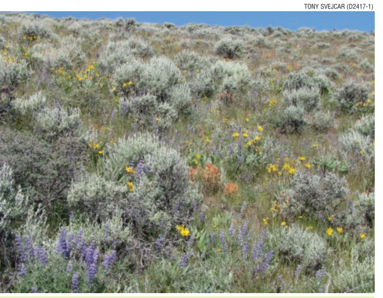
A diverse, functioning rangeland ecosystem with desirable shrubs, perennial grasses, and forbs can help prevent invasive plants from becoming established and taking over.