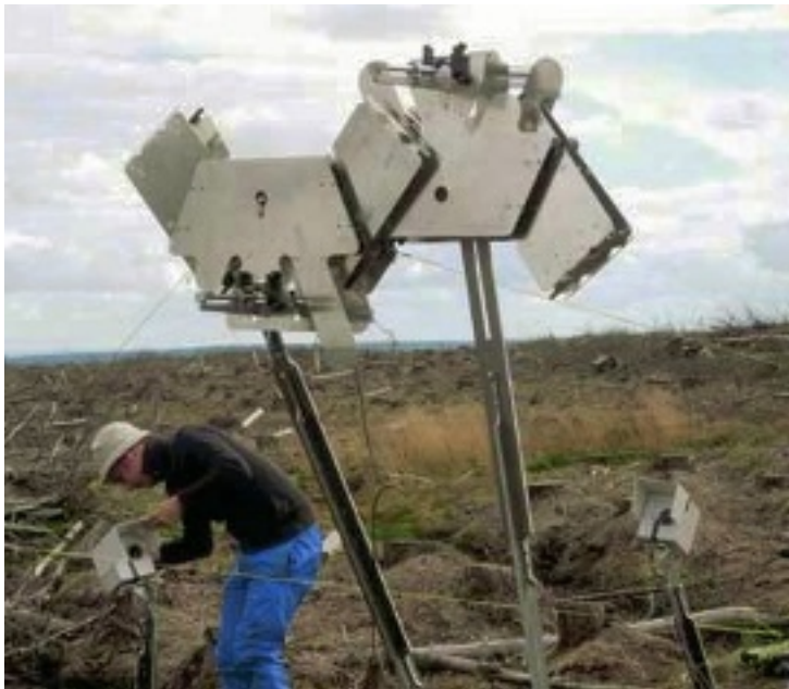
Right: The Bartlett team set up the cells with their own power sources and solid state recording technology so that they would run much like a probe to another part of the solar system