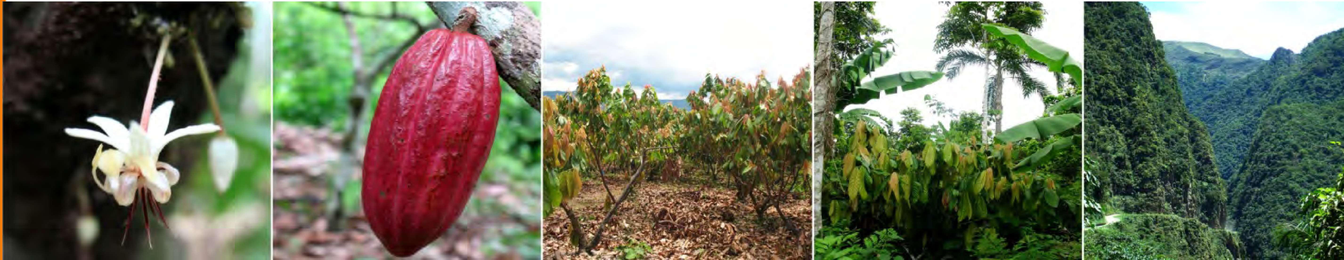
Fig.1 (from left to right) Cocoa flower, cocoa pod, cocoa monoculture, agroforestry system with cocoa, the study area (Yungas)

Background & rationale: Cocoa based small scale agriculture is an important income source for many families in the region Alto Beni in the sub-humid foothills of the Andes. Cocoa cultivation is affected by various climate impacts, soil degradation, pests and plant diseases, fluctuating market prices and a difficult transport situation. Resilience to such stress factors is thus an important feature of sustainable regional development. The concept of social-ecological resilience refers to the capacity of a system to undergo change while maintaining its functions and productivity as well as the capacity for learning and adaptation. Organic agriculture has been discussed with regard to its contribution to resilience building [1]. Therefore, This study compares resilience indicators on organic and non-organic cocoa farms.