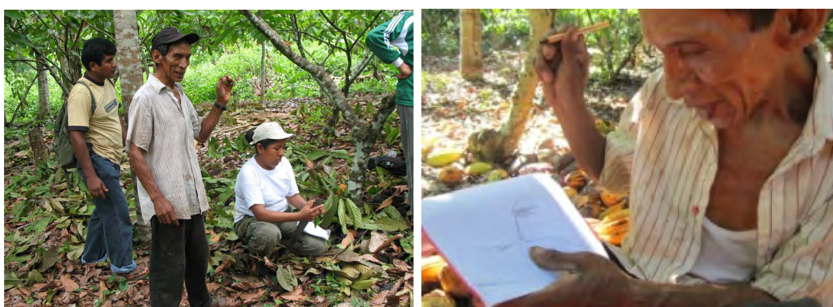
Fig.3 Focus group discussion and farmer interviews

Three focus groups to define indicators, 52 semi-structured open ended interviews with 30 organic and 22 non-organic cocoa farmers [4], transect walks and mapping of trees and crops on the 52 farms, 5 expert interviews, 15 participant observation with cocoa farming families.