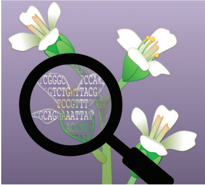
Fig. 1. Data dissemination is key to the development of plant science.

principles and require authors to use internationally agreed nomenclature for data classification (which varies among species) where applicable. However, there are substantial variations in how strictly journals abide by these guidelines; and in the specific requirements and support offered for data-sharing. For instance, The Journal of Experimental Botany explicitly encourages authors to submit gene function data to TAIR, and Plant Physiology has made it a condition for the submission and acceptance of papers. The Plant Cell , by contrast, does not specify through which database data should be made available, but it does require that sequence data be in an easily readable format and allows highlighting to display certain features. Science requires all datasets to be MI-compliant if applicable; whilst Nature specifies submission to a community-endorsed public repository for DNA, RNA, and protein sequence and microarray data. Only one of the major plant science journals provides explicit instructions on how to format metabolomics datasets for inclusion as supplementary materials; some, but not all, journals advise authors to follow the MIAPE standard for proteomic datasets ( http://www.psidev.info/MIAPE ). This diversity of guidelines makes it difficult for authors to understand how best to format and curate data for the purposes of public consultation and prospective reuse.