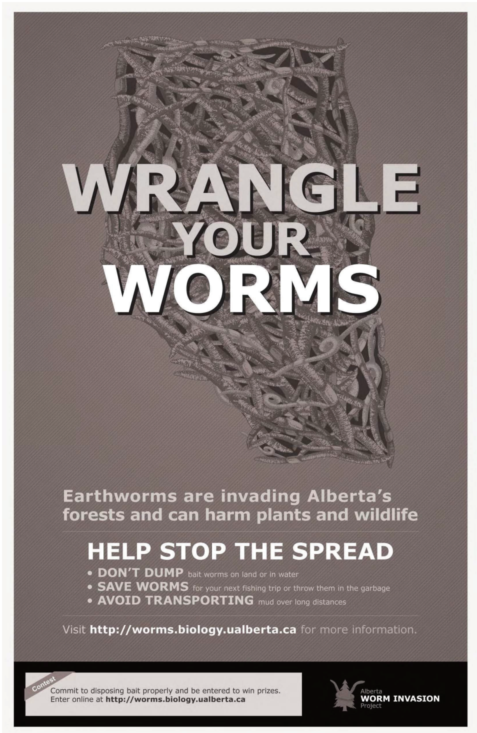
Figure 1. Poster distributed to bait stores as part of our earthworm education program.