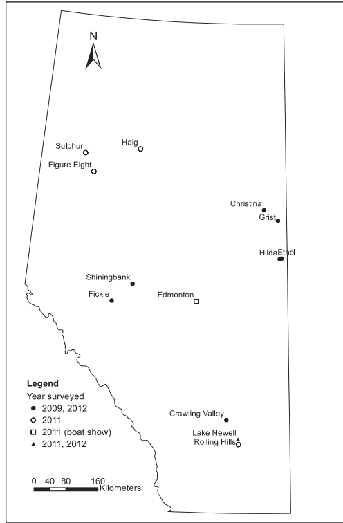
Figure 2. Locations of surveys across Alberta, with ● representing lakes surveyed in 2009 and 2012, ○ = lakes surveyed in 2011, □ = Edmonton Boat and Sportsman Show in 2011, and ▲ = lakes surveyed in 2011 and 2012.