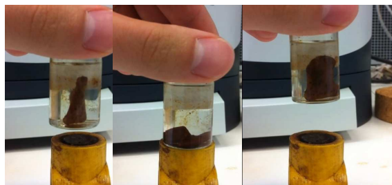
Fig. 1. Magnetic gel contracts rapidly after placing above a permanent magnet but after removing the magnetic field the gel returns to its original shape quickly and reversibly