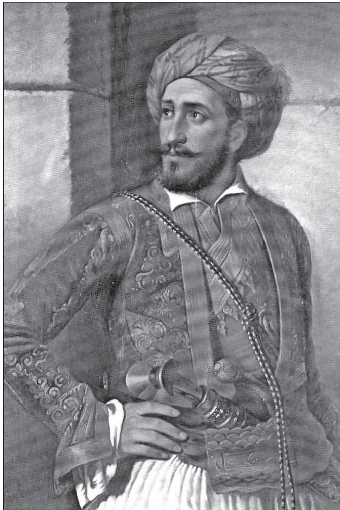
Figure 2 - Greek revolutionary general Ioannis Makriyannis (1797-1864)

Ioannis Makriyannis was born in a small village called Avoriti of Lidoriki in eastern Greece in January 1797. Greece was then under the Ottoman Occupation. His family name was Triantafyllou and the name Makriyannis (Long John) was a nickname that he acquired because of his tall figure; ma-kry in Greek means tall and yannis is a diminutive of his first name Ioannis (John).