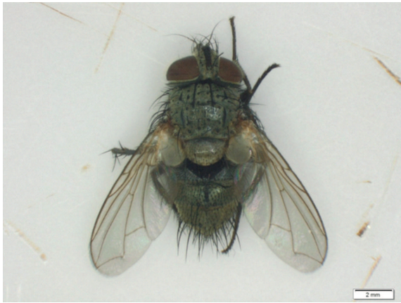
Figure 4. Pupal parasitoid of spotted ash looper: Pales pavidus .

According to references caterpillars moult 4 times, have 5 larval instars and prepupal stage (2, 3). In our research caterpillar moulted 3 times and had 4 larval stages after which a prepupal stage followed. The exact number of larval stages should be tested in field trials in natural conditions. The duration of entire larval stage of SAL is 40–45 days (2, 3). In our research larval stage including the prepupa lasted 29–43 days.