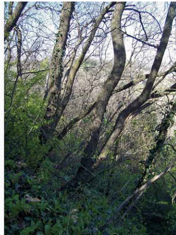
Fig. 2. and 3. Flowering Vinca herbacea and its habitat on Bansko Hill, near Zmajevac