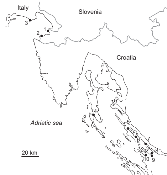
Fig. 1. Plants originating from Italian (3), Slovenian (1, 2), and Croatian (5–10) Salicornia populations.