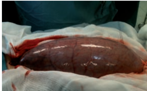
Figure 5. The dilated stomach pops up after xypho-pubic laparotomy.