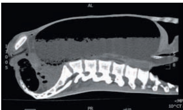
Figure 3. Sagittal CT view shows the distended stomach almost reaching pubic symphysis.