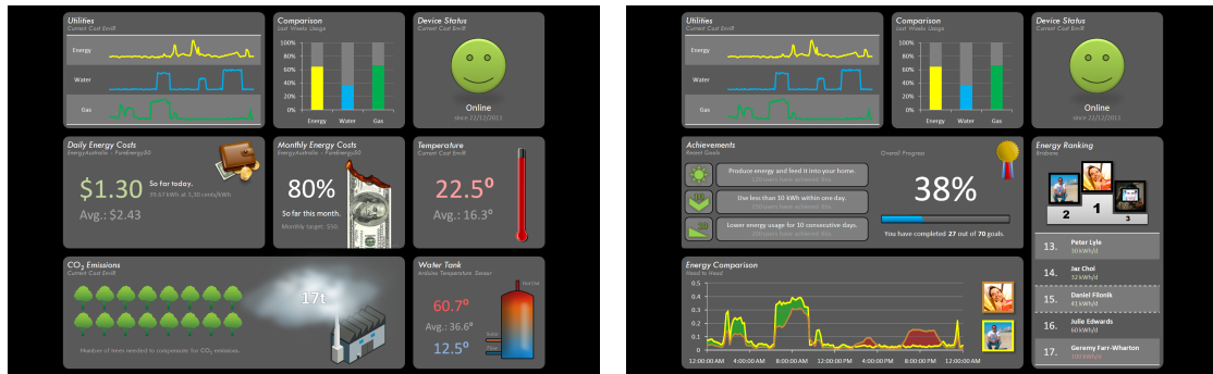
Figure 2: Dashboard mockups