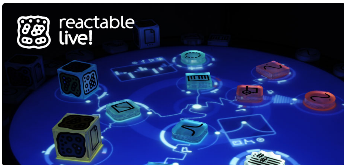
Figure 5: Reactable 14

between the computer and the human during the application development phase. The Reactables (Figure 5) are an example for such an approach as they combine tangible objects with touch-based interaction (multi-touch) on a tabletop surface (Jordà et al., 2007). However, unlike the reactable where the display is mainly used to represent visual feedback on the immediate interaction, the Street Computing approach requires the visualisation of a wider range of information related to specific sensors, services including maps, environmental data, contextualised sensor data and computational elements such as data filters and aggregators. We envisage that this will allow users and developers to explore and simulate the implication of different combinations as part of the process of creating compositions.