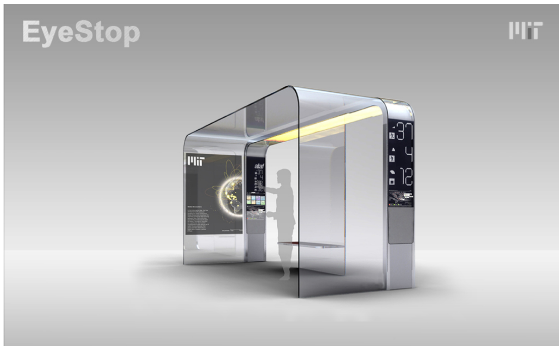
Figure 4: EyeStop by the MIT Senseable City Lab 12

While personal mobile devices have been the predominant platform for interaction away from the desktop in recent years, ambient and situated displays play a similarly important role in Mark Weiser's vision of ubiquitous computing. Advances in interaction technology, like the availability of large-scale multi-touch wall displays have led to an increased deployment of interactive displays in urban environments.