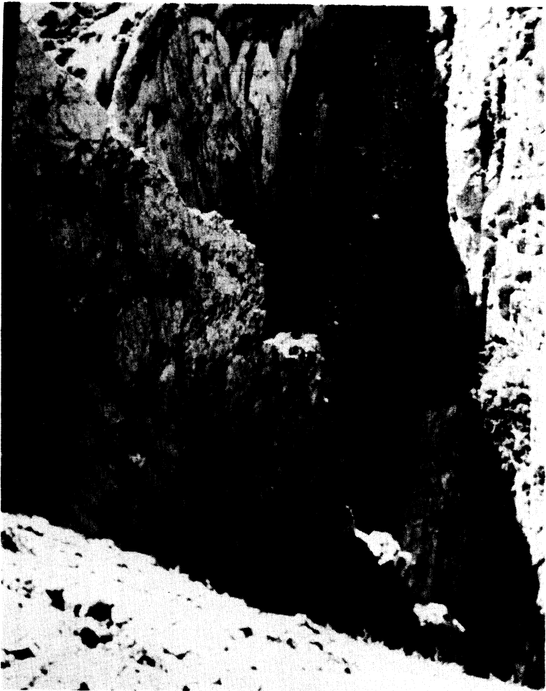
Figure 4: Scene from the Narrow Canyons Category

determined by including all settings with a factor loading greater than |\ .40| on one dimension only. With this criterion, all 40 settings were categorized as we had assumed a priori. Sample scenes from each category are presented in Figures 1 through 4.