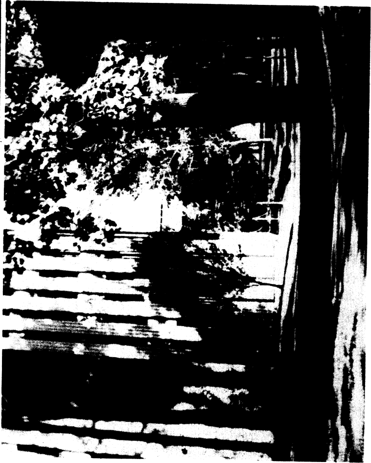
Figure 1: Scene from the Urban Nature Category