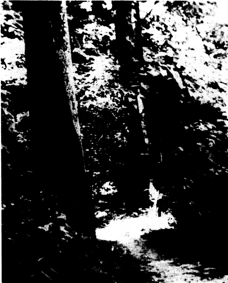
Figure 3: Scene from the Nonurban Nature Category