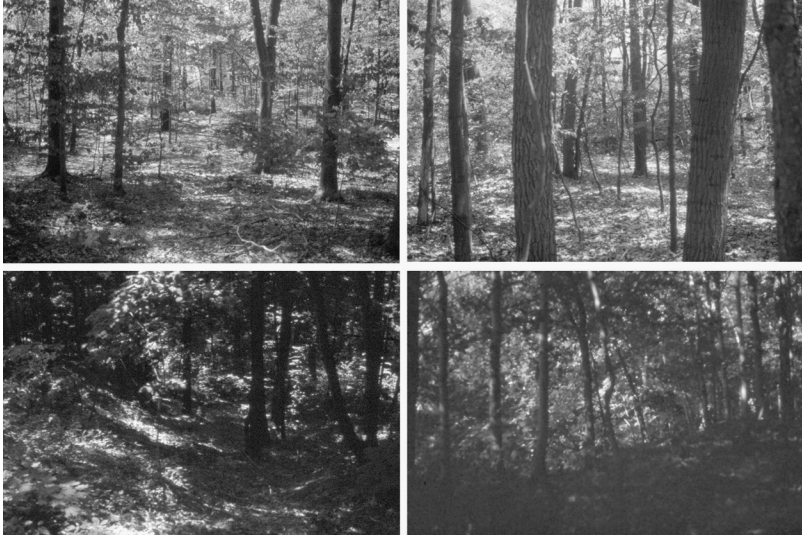
Figure 1 Examples of Settings in the High-Visual-Access (top row) and Low-Visual-Access (bottom row) Setting Categories of Herzog and Kroppscott (2004)

Note: Setting scores for these settings are in Table 1.