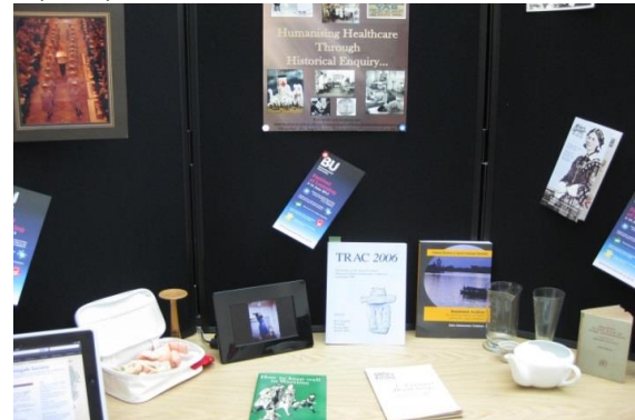
Figure 1. History of Health Exhibition Stand, Festival of Learning, Bournemouth University.