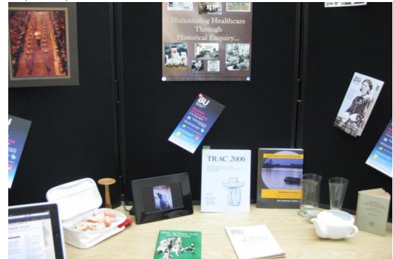
Figure 1. History of Health Exhibition Stand, Festival of Learning, Bournemouth University.