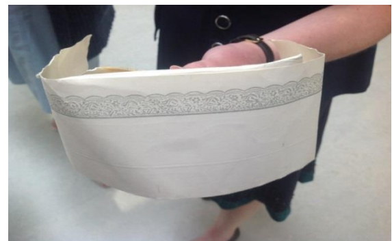
Figure 2. Old cardboard hat, History of Health Exhibition Stand, Festival of Learning, Bournemouth University.