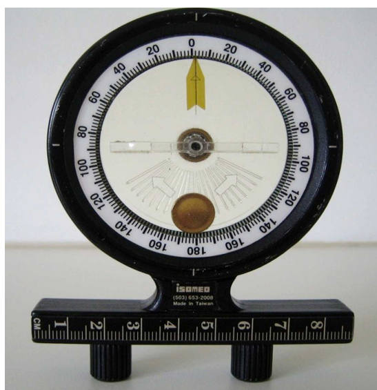
Fig. (1). Isomed Inclinometer.

The experimental hypothesis for this study was that the intra-rater reliability of the investigator measuring thoracic kyphosis angle, lumbar lordosis angle and SLR will show acceptable intraclass correlation coefficients (ICC = 0.91-1.00) indicating reliability suitable for clinical measurements [19].