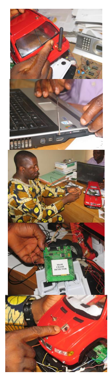
Fig. 3. Production of VAAL prototype in the workshop.

enhance the reliability of the platform for tackling emergency situations. The various pictures taken while VAAL prototype was being built in the workshop are shown in figure 3.