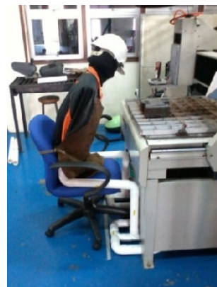
Fig. 2 Dummy welder in sitting position