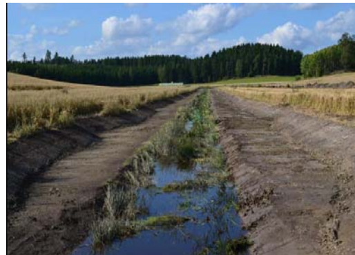
Figure 3.1b. Two step ditches in a sub-catchment of Svärtaån (Photo Judith Braun, 29 August 2012)

The total area of the Svärtaån catchment is 370 km 2 (37 kha), where 93 % (345 km 2 ) is land and 7 % (25 km 2 ) water surface. Of the land area about 25 % (ca.9000 ha = 90 km 2 ) is used for agriculture of which most (ca. 7500 ha) is used for crop production and the rest for pasture. About 55 % of the catchment is forested, and the rest is categorized as other open land (12 %) and urban area (less than 1 %). Cereals occupy ca.40 % (winter cereals are slightly more common than spring cereals) of the total agricultural area and