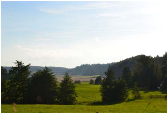
Figure 3.1a. Sub-catchment of Svärtaån (29 August 2012)

The MB evaluations were made for Adaptation scenarios of the Svärtaån catchment in Sweden, latitude ranging ca.58.8 - 59.0°N, and longitude ca.16.9 - 17.3°E (Figures 3.1a-b). Basic information about the catchment is given in Blombäck et al. (2013). Here the site is presented briefly.