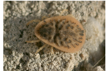
Fig. 9. The pigeon tick Argas reflexus represents the most significant health hazard posed by feral pigeons.

tals or skin folds. The stings of red mites are irritating, but typically harmless.