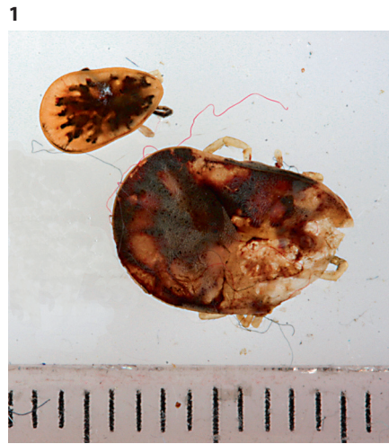
Fig. 2. Red mites Dermanyssus gallinae , some engorged with blood (dark brown intestine).