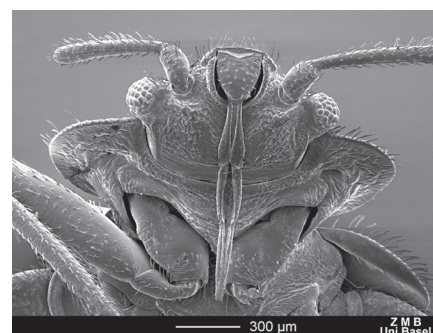
Fig. 6. Portrait of the pigeon bug Cimex columbarius , an ectoparasite specialized on pigeons, that can cause infestations in humans. The back-folded proboscis encases the fine stylets of the feeding apparatus.

showed a skin reaction after bedbug bites, but in most cases only after repeated exposure. With repeated exposure, the latency between bite and skin reactions decreased from approximately 10 days to a few seconds. Bullous rashes may occur subsequent to biting events days later [27]. In some cases these reactions evolve into pruritic papules or nodules that may become superinfected after scratching and persist for weeks. Secondary complications may