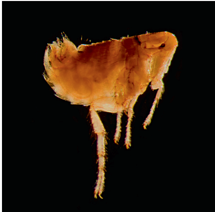
Fig. 7. The pigeon flea Ceratophyllus columbae is very similar to the widespread chicken flea Ceratophyllus gallinae .