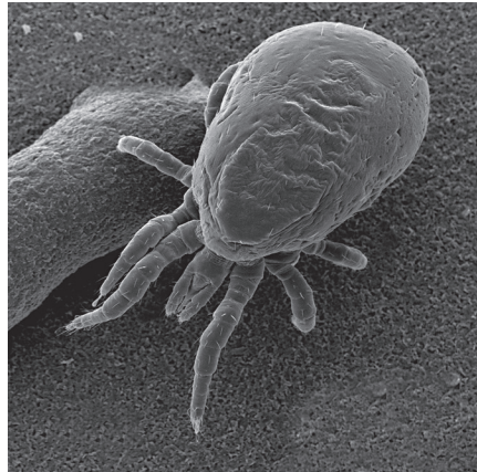
Fig. 8. The red mite Dermanyssus gallinae with its long legs is able to cover large distances when searching for new hosts.