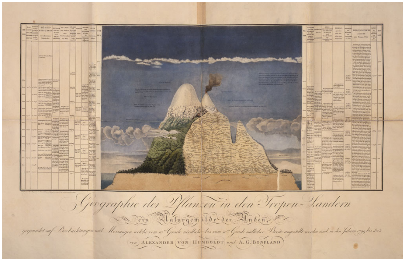
Fig. 1 „Geographie der Pflanzen in den Tropenländern; ein Naturgemälde der Anden, gegründet auf Beobachtungen und Messungen, welche vom 10ten Grade nördlicher bis zum 10ten Grade südlicher Breite angestellt worden sind, in den Jahren 1799 bis 1803“. Coloured

copper engraving by von Humboldt and Bonpland (1807).