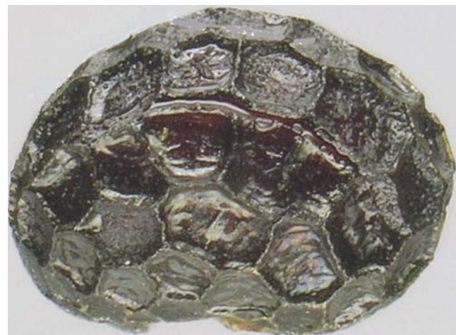
Fig. 7 Seed of Papaver somniferum (opium poppy) from Arbon Bleiche 3; length ca. 1 mm.