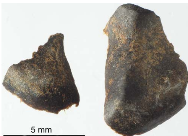
Fig. 4 Seed fragment of Pinus cembra (Arolla pine) from the settlement of Arbon Bleiche 3.

The weed spectrum gave hints as to the location of the fields and agricultural activities. All the potential segetal plants identified (see Hosch and Jacomet 2004) mainly grow on nutrient rich soils. Therefore, areas with favourable conditions had been chosen for fields. Such places would have been available on the slightly inclined moraine immediately behind the settlement. The weed spectrum, rather different from modern pre-industrial spectra, did not provide clear indication of the sowing times. One must, however, assume that autumn and spring sown crops were cultivated. Soil preparation was effective, with tools like wooden picks or maybe an ard being used (see below, draught animals and yoke). There was no evidence for slash-and-burn agriculture (see Rösch et al. 2002). Rather, the weed spectra indicate that the fields were not established on newly cleared areas. It is much more likely that permanently and intensively cultivated plots were created,