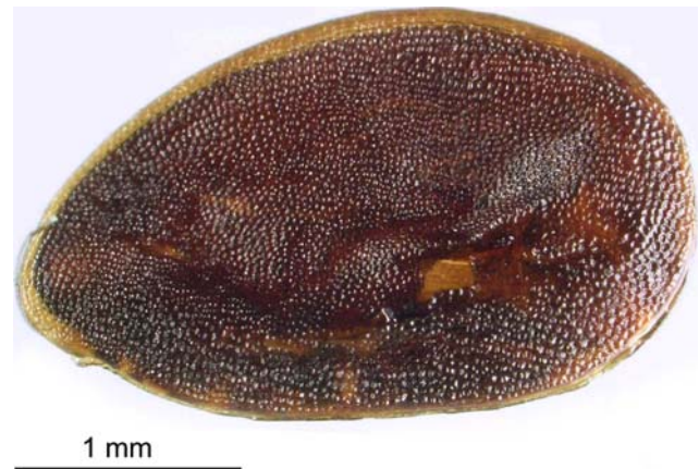
Fig. 6 Seed of Linum usitatissimum (flax) from Arbon Bleiche 3.

Animals were kept within the settlement itself only for part of the year, during the winter months. Some of them would certainly have been kept nearby during the summer