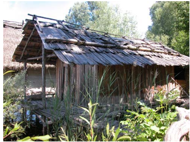
Fig. 5 Reconstructed house from Arbon Bleiche 3 in the open air museum at Unteruhldingen on Lake Constance (Bodensee), Germany.

as also proposed by Bogaard (2004) for other Neolithic settlements.