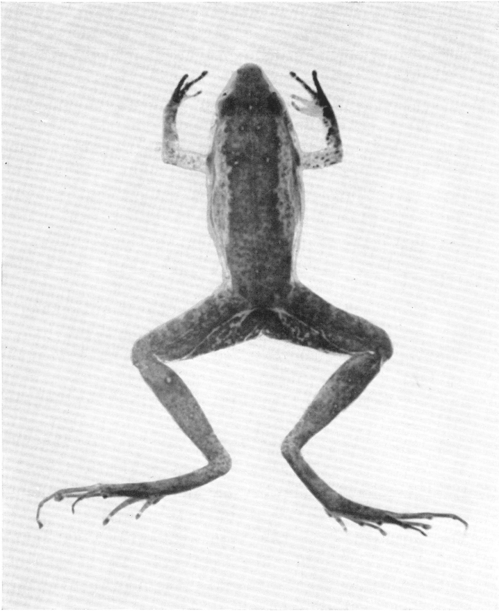
FIG. 3. Eleutherodactylus d. amelasma , new subspecies, holotype, A.M.N.H. No. 59830, from entrance of a small cave just south of San Vicente, Pinar del Río Province, Cuba. Enlarged; actual snout-to-vent length 31.1 mm.

almost at the lateral margin of the roof of the mouth, curving antero-medially, the apex of the curve just mediad to the choanae, and thence posteromedially to about the same level as the lateral end of the series; vomerine tooth series separated from each other at midline by a distance about equal to one-fourth of the length of a single series.