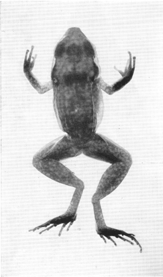
FIG. 4. Eleutherodactylus etheridgei , new species, holotype, U.M.M.Z. No. 110180, from United States Naval Base, near Guantánamo Bay, Oriente Province, Cuba. Enlarged; actual snout-to-vent length 18.9 mm.

veloped. Toes relatively short and slender, unwebbed, 4-3-2-5-1 in order of decreasing length. Heels overlap when femora are held at right angles to body. Venter smooth centrally, becoming granular peripherally; throat smooth; under side of thighs with pavement-like granules. Belly disc rather well developed, with a prominent fold between axillae, and a somewhat less prominent fold across belly anterior to hind limbs. Tongue ovoid, slightly notched and free posteriorly. Vomerine teeth in two long, almost straight series, extending from behind