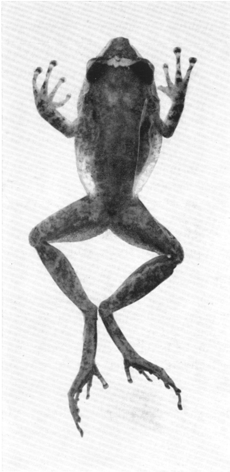
FIG. 1. Eleutherodactylus gehrmanni , new species, holotype, A.M.N.H. No. 59828, female, from San Vicente, Pinar del Río Province, Cuba. Enlarged; actual snout-to-vent length 23.0 mm.

Tongue ovoid, slightly notched and free posteriorly, densely papillate anteriorly. Vomerine teeth in two short, straight series, extending from the choanae posteromedially; anterior end of vomerine series separated from choana by about the diameter of the latter; medial ends of vomerine series widely separated by a distance equal to about three-fourths of the length of each individual series.