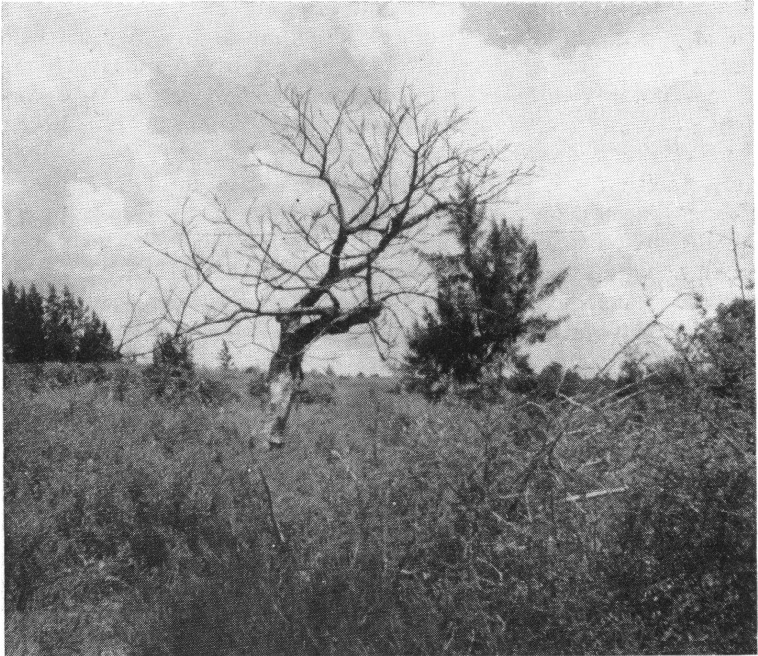
FIG. 9. Dead Spondias purpurea , northwestern South Bimini.

A far greater number of species and individuals, especially of cerambycids, was found at Rolle's burnt-over yard on the ridge which is the place we frequented most often at night.