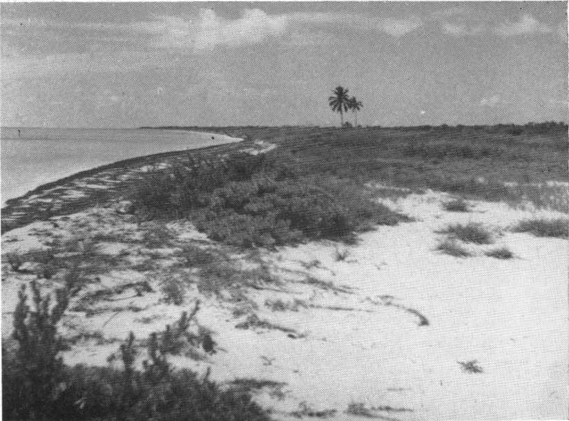
FIG. 2. East Bimini, northwestern end.

The numbers and variety of insects collected on South Bimini would no doubt have been much less had it not been for the work of a Mr. Rolle who had partially cleared and burnt an area on which he intended to build a house and raise a few crops and chickens (fig. 3). His land was situated on what is known locally