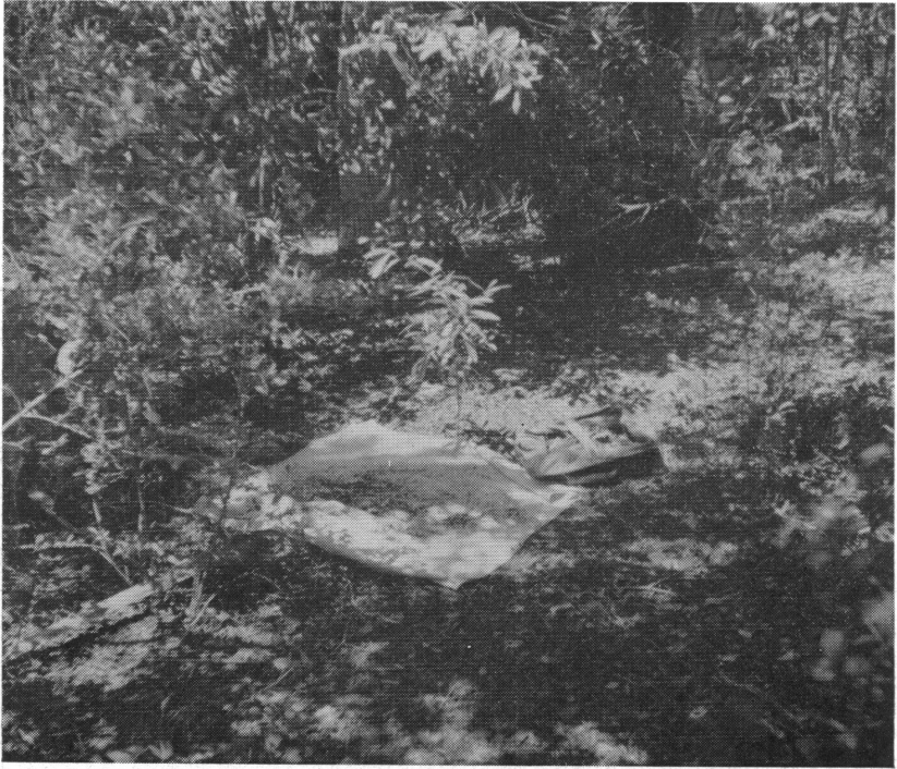
FIG. 7. "Jungle" path behind Rolle's on Sampson's ridge. Sifting for small insects.

Another daytime collecting area on South Bimini was the northeastern shore, but it could be visited at high tide only, as the bay water was too shallow for the outboard motor at other times. Much of this coast is rimmed with mangrove, but a rocky