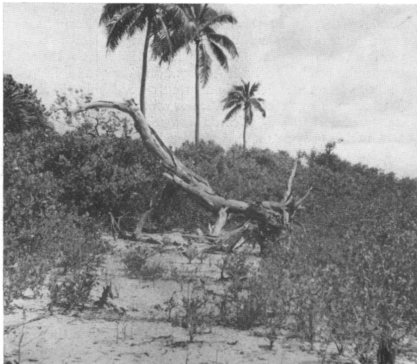
FIG. 4. Western edge of Cavelle Pond; young black mangrove ( Avicennia ) at right; white mangrove ( Laguncularia ) and button wood ( Conocarpus ) at left.

bushes and inhabited, in addition to buprestids, by tiger beetles, flies, and wasps. According to Howard (1950, p. 333) this western margin along Cavelle Pond is being invaded by some of the black land plants from the ridge (fig. 6). In a grassy area near by Cazier made an exciting capture of the variegated Acmaeodera marginenotata , a buprestid of which but one specimen had been taken the year before.