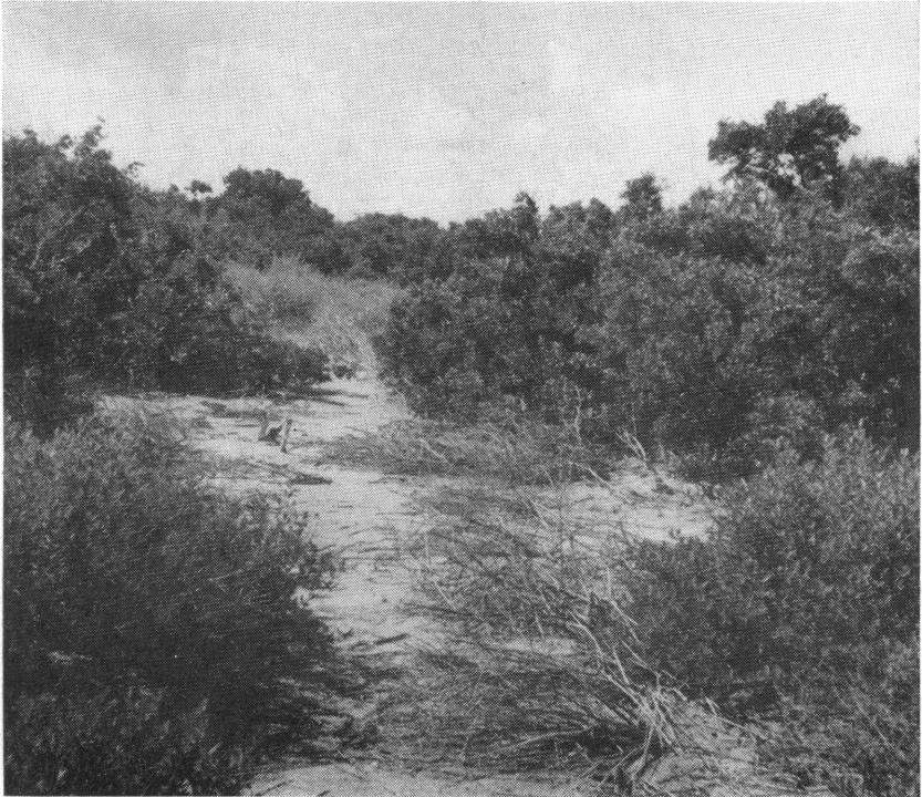
FIG. 5. Western edge of Cavelle Pond, "Paratyndaris Boulevard," with Psiloptera trees ( Laguncularia and Conocarpus ) in right background.

In what we called the "jungle" behind Rolle's yard is a narrow path along which we swept a series of a small red curculionid of