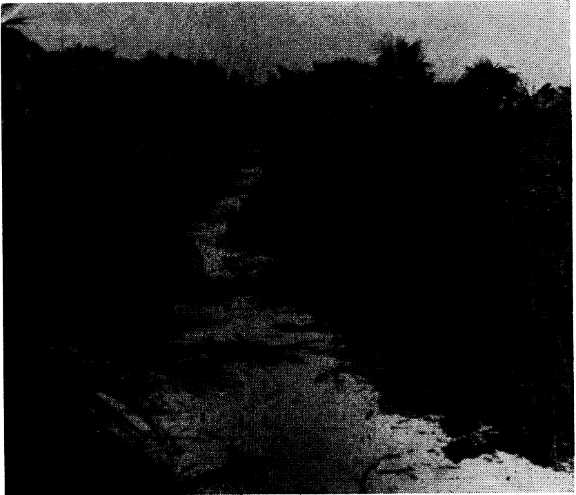
FIG. 8. Beach path looking south. Coastal rock area.

as it flew along a small inland path, Rutela formosa , a beautiful striped cetonid. He also took the second Bimini specimen of Chrysobothris tranquebarica , a buprestid that is widespread throughout the West Indies (Fisher, 1925), but seemingly scarce in the Bahamas. Its food plant is the red mangrove and the Australian pine, both plentiful in the Biminis so that it is strange no more were seen.