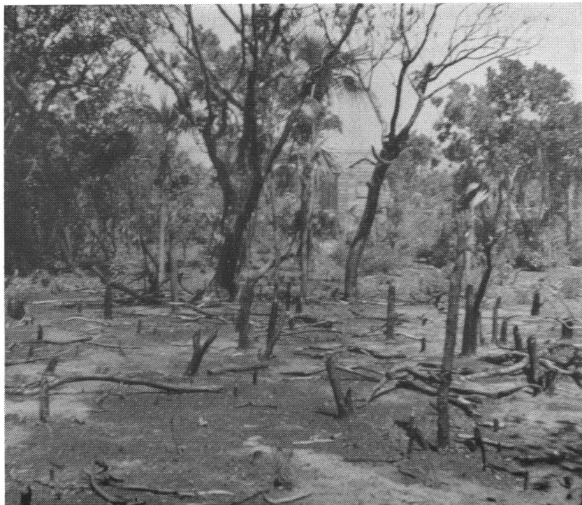
FIG. 3. Rolle's yard on Sampson's ridge; Spondias purpurea in center background.

the middle of May Cazier had found collecting excellent, especially at night. Additional chopping and firing of trees and brush around the yard went on sporadically throughout the summer, resulting in a continual supply of beetles, no matter how often we hunted for them. The rows of burnt stumps, the singed, felled, or broken trees, and the piles of dead limbs and twigs made