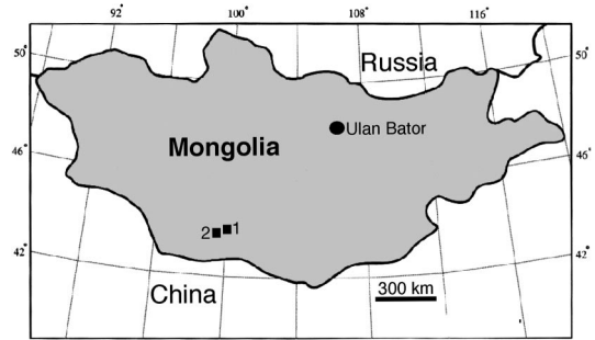
Fig. 1. Map showing the Mongolian Late Cretaceous localities of Gurilyn Tsav (1), where PIN 4499-1 was found, and Bugeen Tsav (2). Both have been dated Campanian to Early Maastrichtian in age (see text for details).

STRATIGRAPHIC AND GEOGRAPHIC DISTRIBUTION: Members of Presbyornithidae are known from the Upper Cretaceous of Mon-