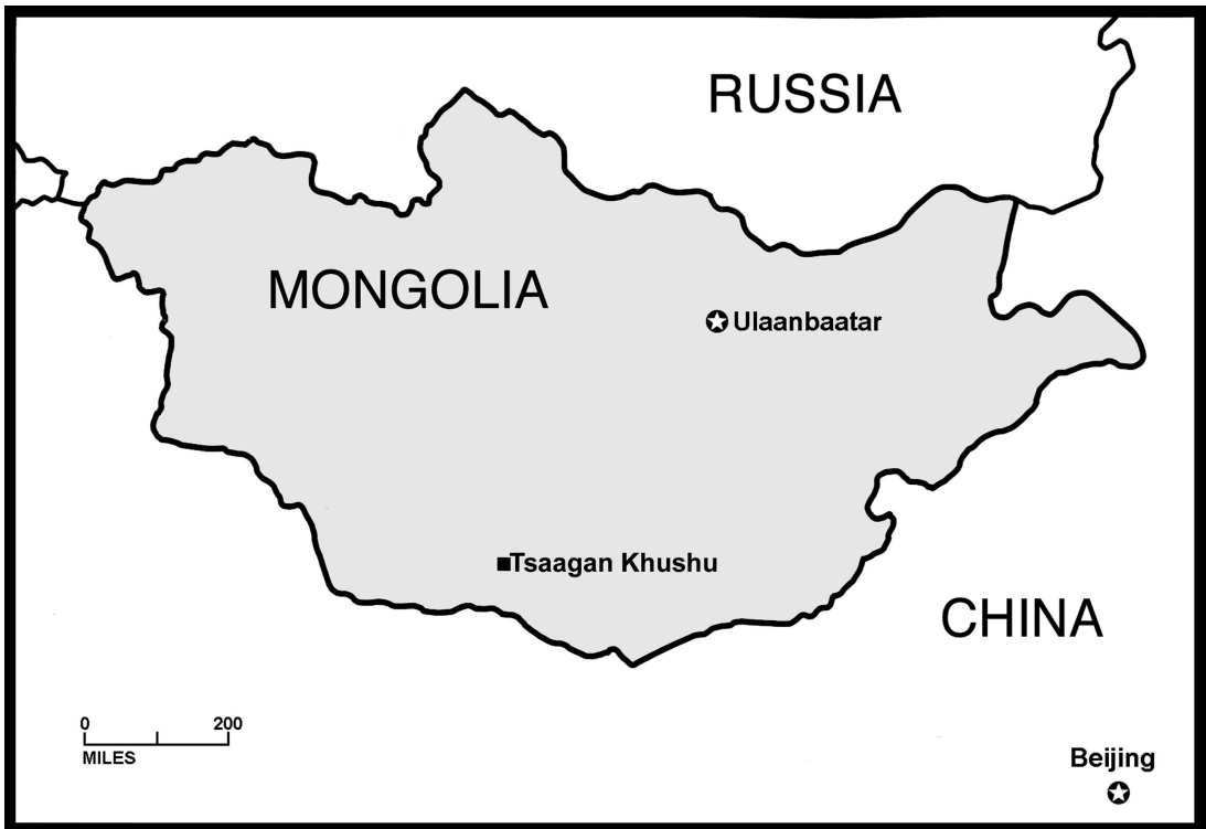
Fig. 1. Map of Mongolia indicating where the fossils were recovered, the locality of Tsaagan Khushu in the western Gobi Desert (Omongov Aimag).