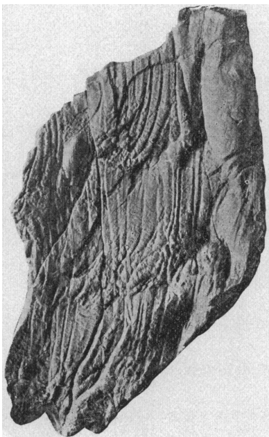
No. 3. \frac{1}{2} nat. size.