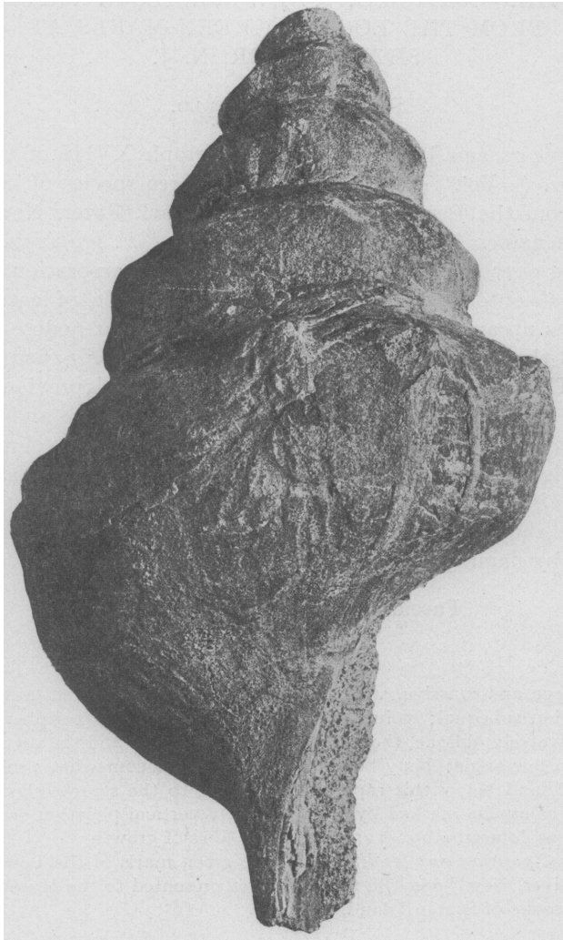
Fig. 1. Fasciolaria crookiana , front view.