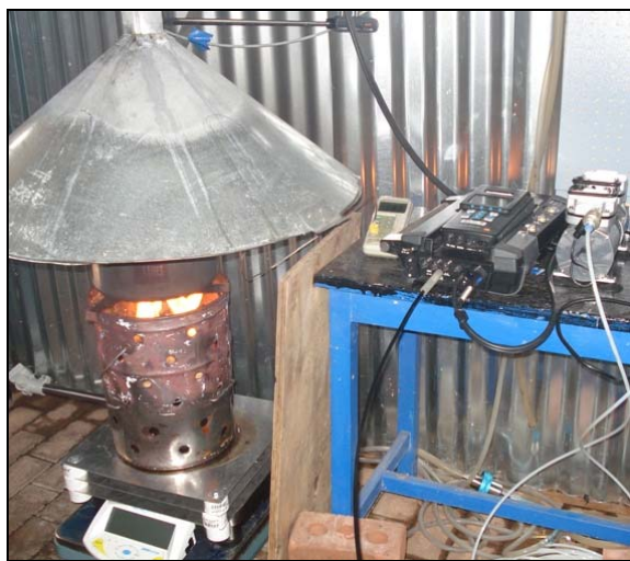
Figure 3: Imbaula test assembly