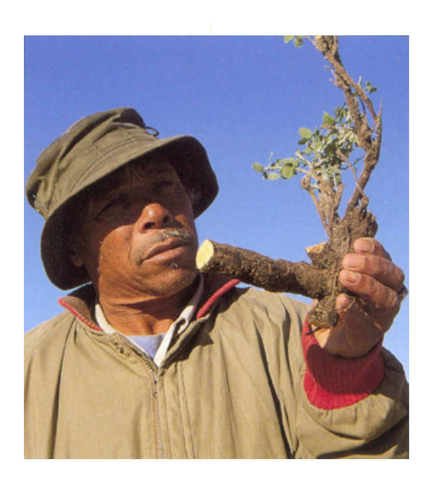
Cape bossiedokter holding a sample of Cissampelos capensis.