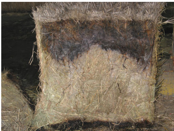
Fig. 5.2 Large rectangular bales are susceptible to spoiling on the top and bottom of the bale if not stored properly. This bale was cut in half to expose the spoilage on the bale interior

have compositional changes during storage. Biomass degradation from weather and microbial activity can be as high as 42% by volume for a round bale [65]. For large rectangular bales, moisture can penetrate at the top of the bale or can be absorbed at the bottom of the bale. A large rectangular bale is comprised of a number of layers of switchgrass compressed together. Water channeling can occur within these layers causing heterogeneous spoilage ([38]; Fig. 5.2).