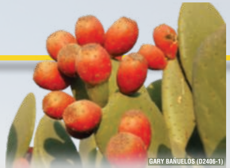
GARY BAÑUELOS (D2406-1)

Prickly pear was thought to be sensitive to high salinity. But the study results showed that tolerance to salt and boron depends on the genotype. The cactus variety from Chile had the highest tolerance and was the best at producing fruit and accumulating and volatilizing selenium. Many of the plants grown in test plots were smaller and produced less fruit than those in control plots, but some varieties actually grew better in the test plots. The results were promising enough for selected prickly pear