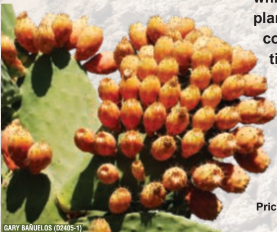
GARY BAÑUELOS (D2405-1)

The west side of the San Joaquin Valley in California presents several challenges to growers. Ancient seas that once covered the area left behind marine sediments, shale formations, and deposits of selenium and other minerals. Anything grown there needs to be irrigated, but the resulting runoff, when it contains high levels of selenium, can be toxic to fish, migratory birds, and other wildlife that drink from waterways and drainage ditches. Selenium runoff is subject to monitoring by regional water-quality officials. Periodic droughts and population growth are also