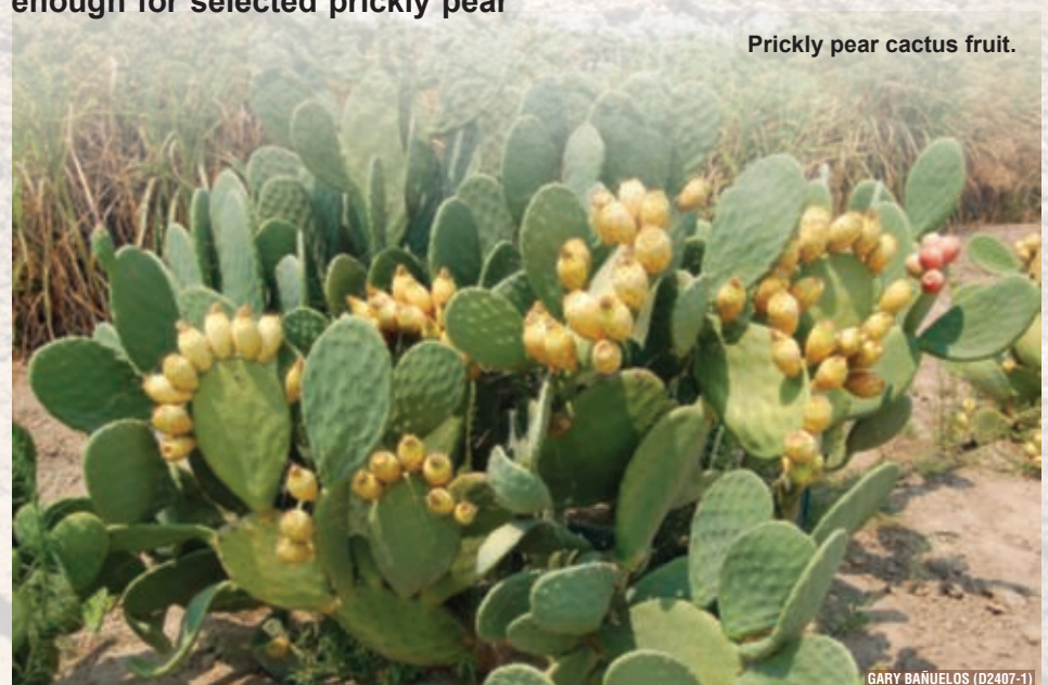
Prickly pear cactus fruit.