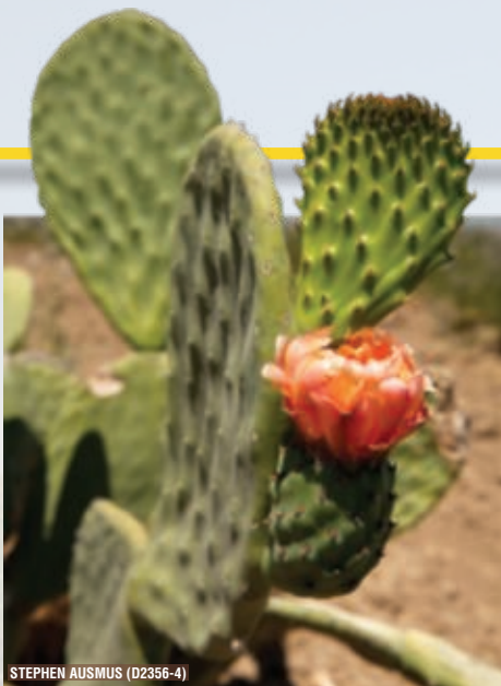
STEPHEN AUSMUS (D2356-4)

Newly emerging cladode with flower on field-grown prickly pear cactus, Opuntia ficus-indica .